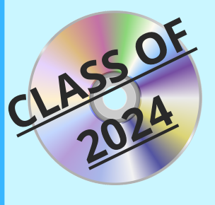
UCS Graduation DVD