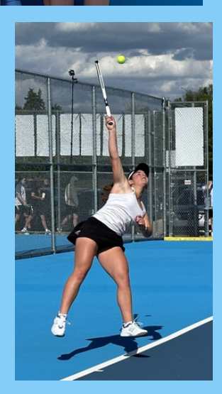
GIRLS TENNIS - MAC RED CHAMPS!! 22-23 & 23-24!!